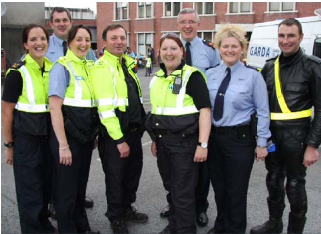
The team at Tralee Garda Station gave a warm welcome at the Station's first open day in September 2011.

positive feedback, and Tralee Gardaí found the experience to be an extremely positive way of raising their profile in the community.