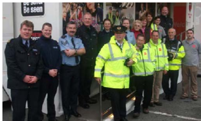
Shankill Community Gardaí and staff from the Road Safety Authority worked closely together at the road safety event at Shankill Garda Station in November 2011.

On 2 November 2011, the Shankill CPU held a road safety event which was attended by approximately 800 people. Dublin Fire Brigade gave a demonstration on how they would attend to a serious traffic collision and also talked about the machinery and equipment they use. Paramedics from the HSE ambulance demonstrated how they would respond to a crash scene. Personnel from GoSafe, the private operator of Garda speed cameras, were present and explained the objectives of GoSafe operations. Road Safety Authority personnel also attended the event with their shuttle bus, which is fitted with various simulators and proved to be a very effective educational tool. Members from the Garda National Traffic Bureau (GNTB) assisted with