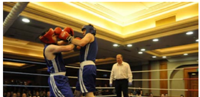
Members of An Garda Síochána in action at the fundraising boxing event at the Stillorgan Park Hotel.

The event generated superb public support, community involvement and good publicity for the Balbriggan community, and also raised €4,500 for the Remember Us Group which provides an invaluable service to families living with and caring for people with special needs.