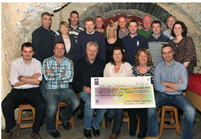
Participants in the charity cycle/climb raised over €20,000 for Crumlin Children's Hospital Dublin.

Community Policing Units in the Galway Division had a busy 2011, highlights of which included an Open Day at the Garda Ballybane Community Office , the establishment of a new Neighbourhood Watch Scheme in the Maunsell's Road Area, and the hosting of a local Polish School at Ballinasloe Garda Station during Social Inclusion Week. In May 2011, Gardaí based in Salthill organised a Charity Cycle/Climb , the