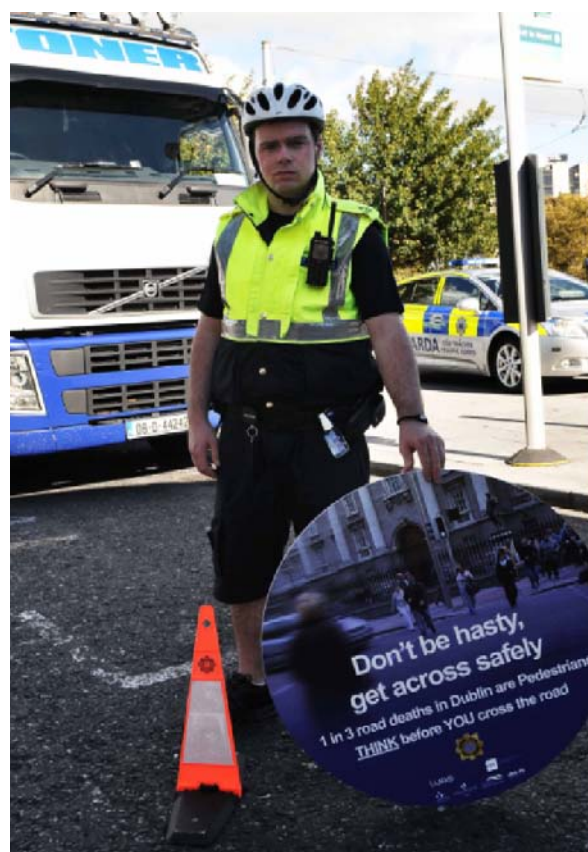
The launch of the 'Don't be hasty' campaign at Heuston Station, Dublin in September 2011, which aimed to raise awareness of road safety among pedestrians.

2011 stands at 171, this is 11 less than in 2010. The number of fatal collisions has decreased year on year since 2005.