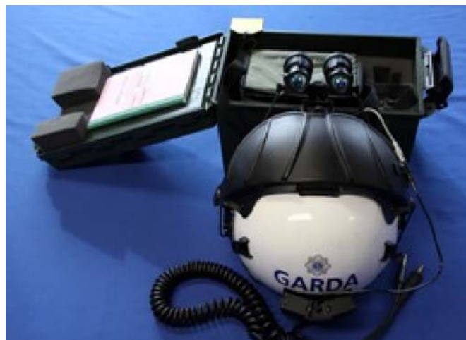
The new Night Vision Goggles make night time flights possible.

On 7 July 2011, the Garda helicopter responded to a call for assistance from Portumna Gardaí regarding incidents of aggravated burglary, burglary and robbery. A number of suspects had fled from investigating Gardaí into an area of forestry and open country. The helicopter conducted a thermal image search of the area and the crew detected a faint thermal heat signature from one of the suspects, who had