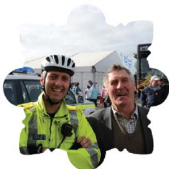
Working With Communities

December | 2011 COMMUNITY TIMES PUBLIC EDITION