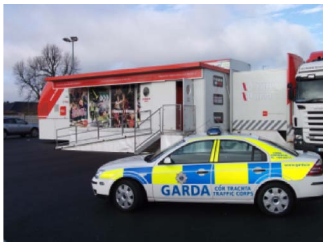
Over 800 primary school pupils from Ardee attended the Garda Road Safety Event.

President Mary McAleese launched the Louth Age Friendly County website during 2011. The Louth Garda Division has a dedicated webpage on this site which is updated regularly with security and crime prevention advice as well as contact details for every Garda station in Co. Louth and the names and contact details of Community Gardaí across the county.