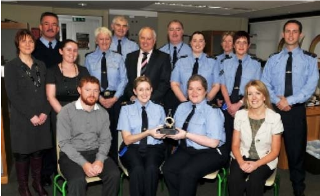
Members of the Garda Professional Standards Unit, who were awarded a Q Mark for Quality Management Systems.

In recognition of the GPSU's Continuous Improvement Programme, Excellence Ireland Quality Association (EIQA) awarded the Unit a Q Mark for Quality Management Systems, in the "Journey Towards Excellence" Category, at the National Q Mark Awards in October 2011. The unit won the award ahead of a number of other organisations in the public and private sector.